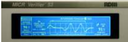
Dimension error screen

Operators appreciate the ease and speed of operation, allowing them to constantly monitor quality and call for service.